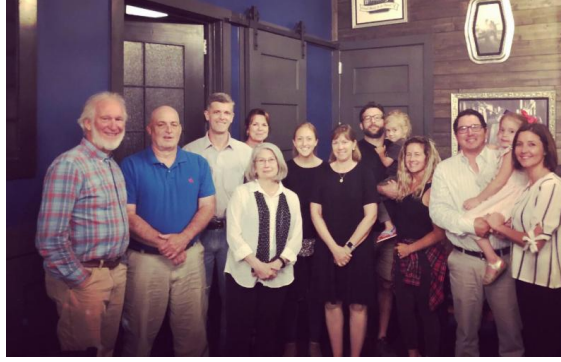
Slow Money kick-off in Virginia Beach at The Butcher's Son on May 1, 2019