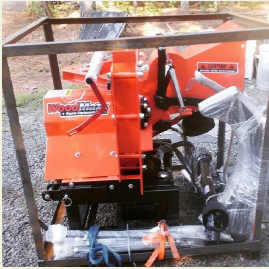
New chipper at Heart & Bones Hollow