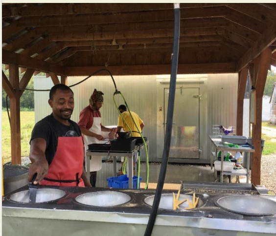
Processing day at River Oak Farm with their new outdoor walk-in cooler/freezer

Nurture Capital continues to do its job in our local foodshed and it's been a busy month! Pictured below are the results from several loans we've made recently.