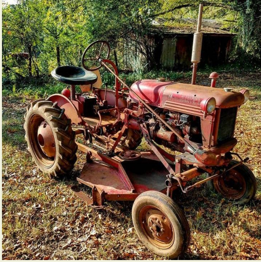
New used tractor at delli Carpini Farm