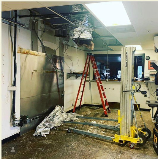
Kitchen renovations underway at Commune