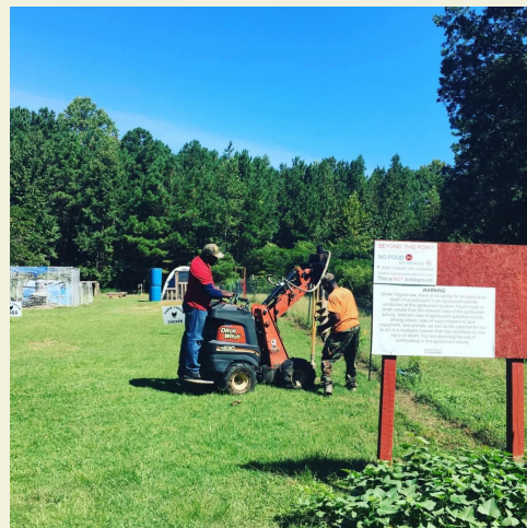
Fence installation at Panda Homestead