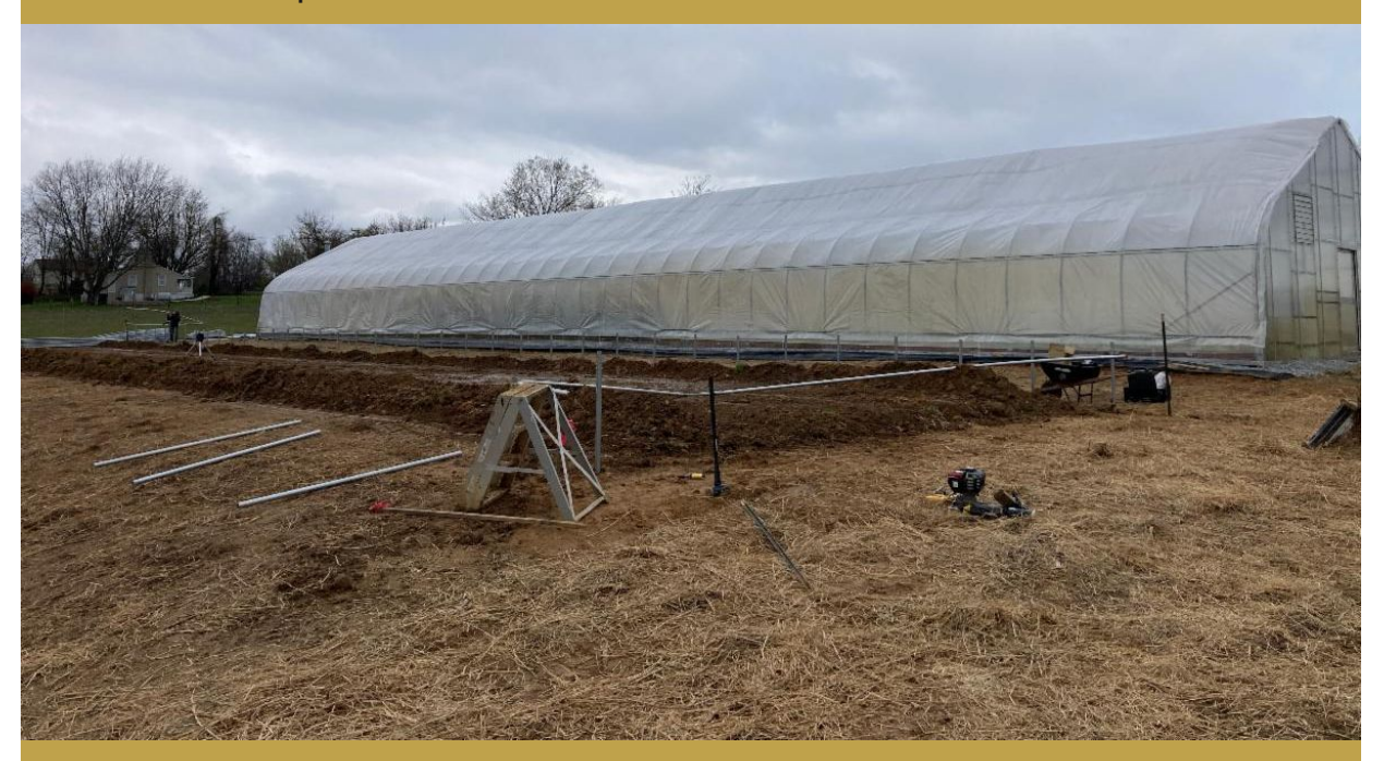
New high tunnel going up at <u>Root and Marrow Farm</u> in Loudoun County.

Our farm partners continue to be busy with projects funded by Foodshed Capital loans. Check out a few below.