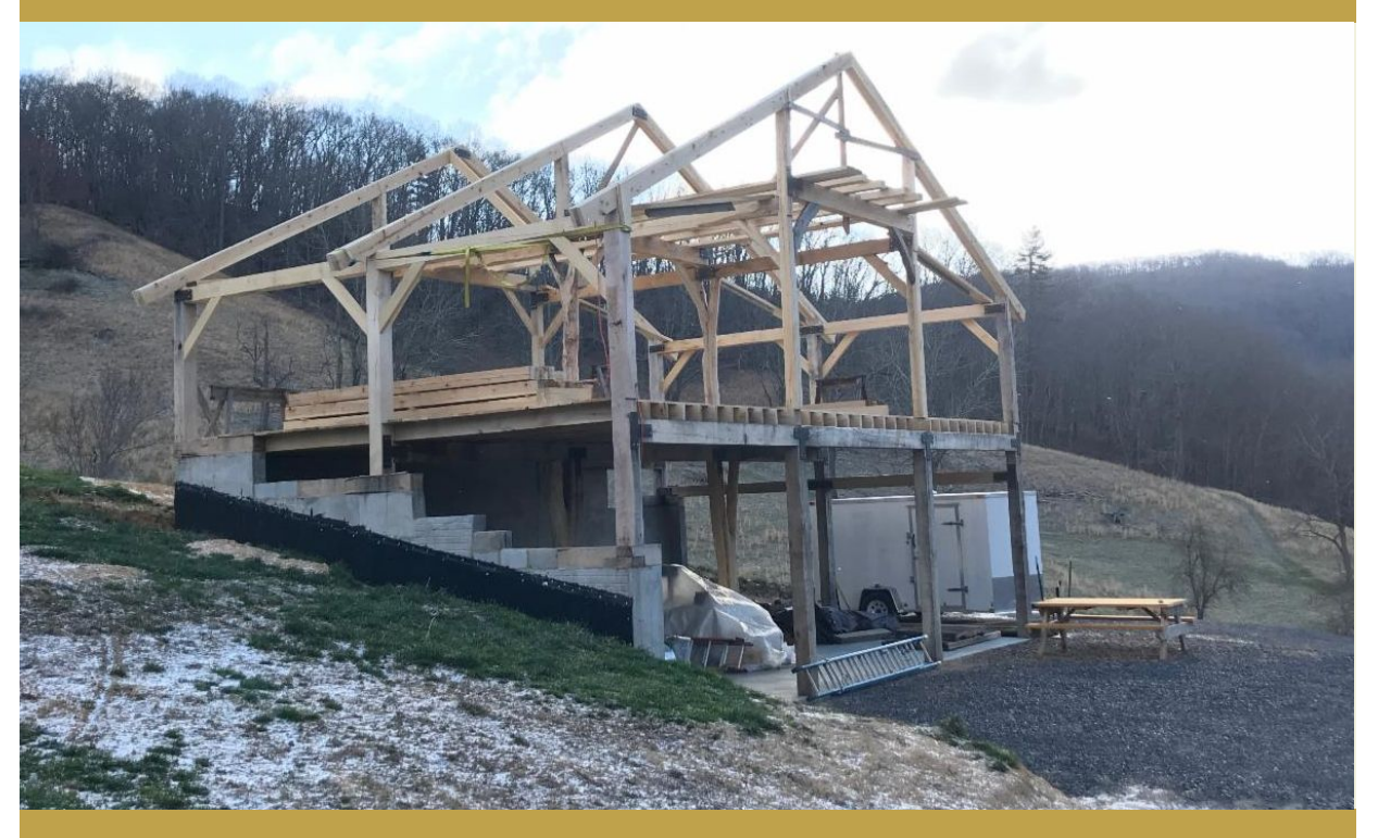
New workshop being constructed at <u>Tonoloway Farm</u> in Highland County.