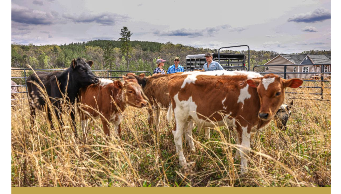
Herd of cattle arriving at <u>Purple Mockingbird Farm</u> in Appomattox County, as part of a program through the Savory Institute.